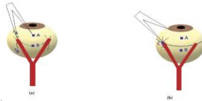
Figure 2: A sketch of Y-split recession, side view. (a) The first orientation point (“A”) is given by the middle of the natural muscle insertion. The second orientation point (“B”) is located 6 mm straight behind A. With a compass, the distance rA is marked with color on the globe. The same procedure is repeated from B, with the distance rB . The intersection of the two marked lines indicates the new insertion points for the split-muscle halves. (b) The “control distance” (“C”) ensures correct placement of the new insertion points